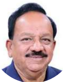
Dr. Harsh Vardhan

AAPI is the largest ethnic medical society in the US, second only to AMA. AAPI represents 60,000 physicians of Indian Origin and 20,000 students, residents, and fellows of Indian origin. It has 160 component chapters. Our flagship, AAPI Charitable Foundation has supported numerous charitable causes in India and USA.