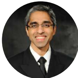
Dr. Vivek Murthy